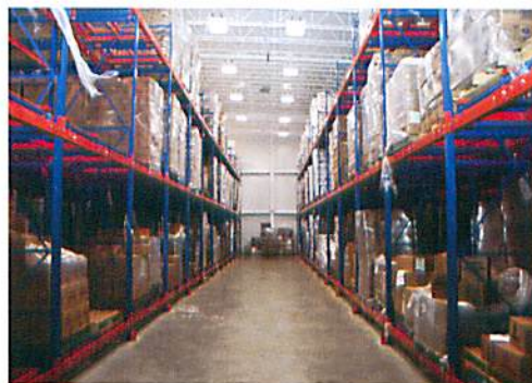
New freezer holding 30 trailerloads of products

The added storage capacity helps in many ways.